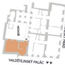
UMÍSTĚNÍ V RÁMCI PODLAŽÍ