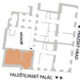
UMÍSTĚNÍ V RÁMCI PODLAŽÍ