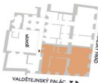
UMÍSTĚNÍ V RÁMCI PATRA