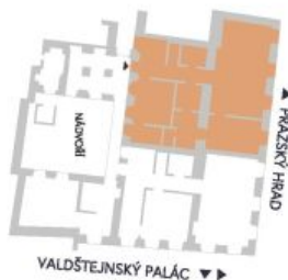
UMÍSTĚNÍ V RÁMCI PODLAŽÍ