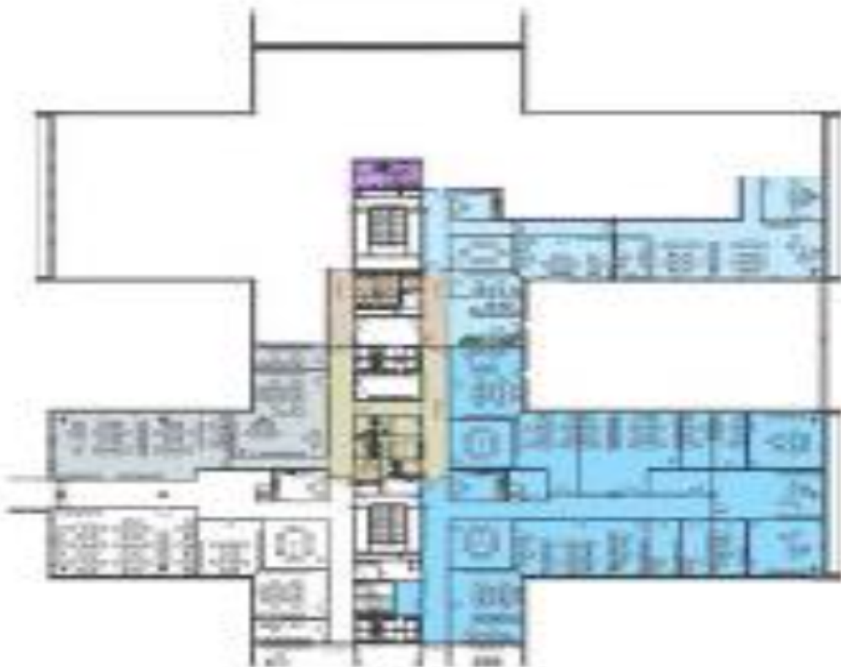
1. patro / 1st floor