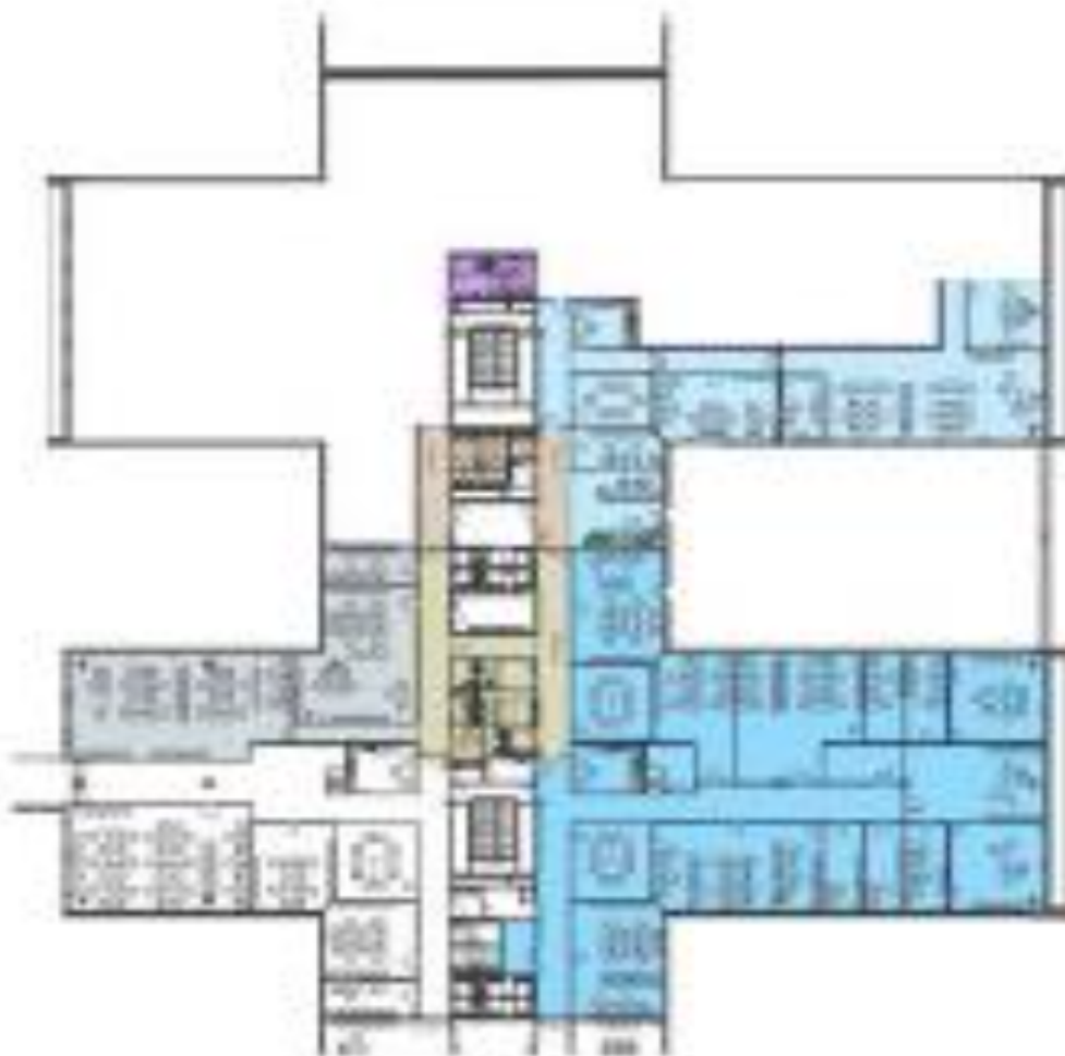
1. patro / 1st floor