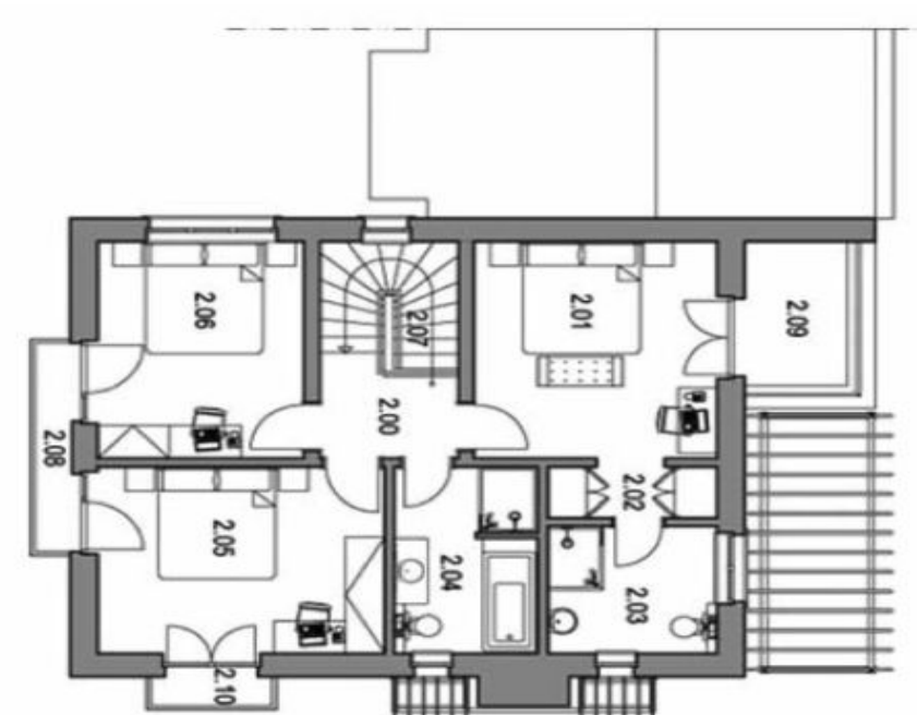
PŮDORYS 2. NP FIRST FLOOR