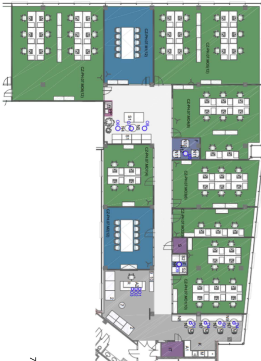
7. patro / 7th floor